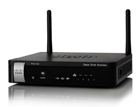
Figure 1. Cisco RV215W Wireless-N VPN Router

The Cisco® RV215W Wireless-N VPN Router provides simple, affordable, highly secure, business-class connectivity to the Internet from small and home offices and remote locations.